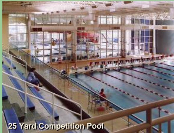
25 Yard Competition Pool

Ridgeland Common Park District of Oak Park